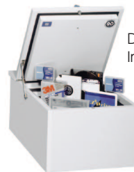
Data protection Insert FSDPI08